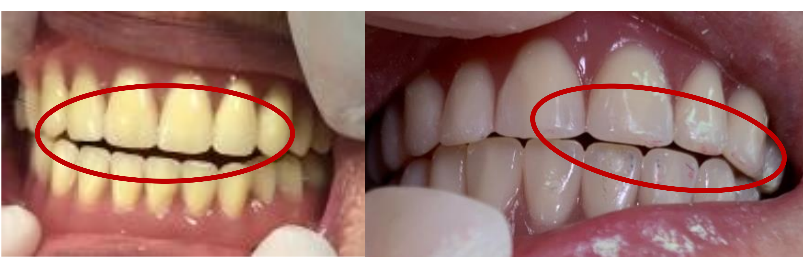
Figure 3. Common mistakes by technicians; open bite present